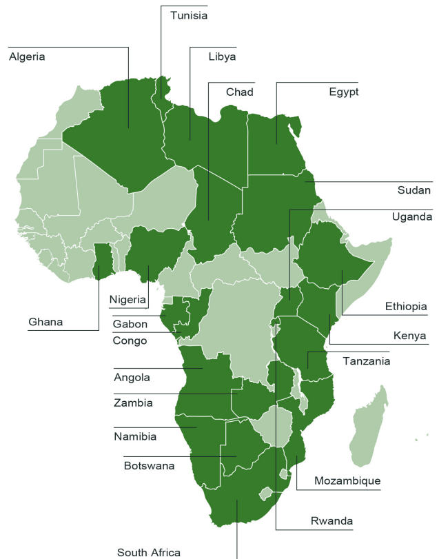
Key ■ Experience in International Disputes

The Africa-related disputes we have handled cover a broad spectrum of industry sectors, including telecommunications, energy (oil and gas), banking, construction, retail and manufacturing.