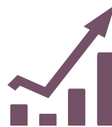
Employment – Band 3 Chambers Global, 2019

We talk with our retail and consumer products clients every day in clear and straightforward terms about complicated employment-related and industry-specific issues. Whether you are facing employment related issues in one country or around the world, we're here to help.