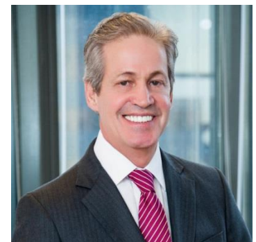
Norm Coleman Senior Counsel Washington, D.C., Minneapolis Tel +1 202 637 5440 norm.coleman@hoganlovells.com