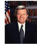
Finance Max Baucus D-Mont.