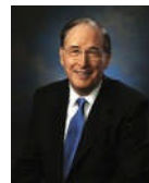
Commerce, Science, and Transportation Jay Rockefeller D-W.Va.