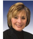
Environment and Public Works Barbara Boxer D-Calif.