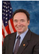
Dan Lungren R-Calif.