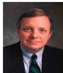
Majority Whip Dick Durbin D-Ill.