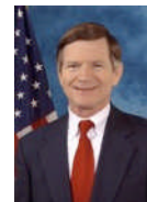
Lamar Smith R-Texas