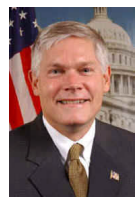
Pete Sessions R-Texas