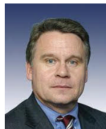
Chris Smith R-N.J.