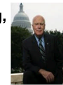
Judiciary Patrick Leahy D-Vt.