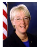
Democratic Conference Secretary Patty Murray D-Wash.