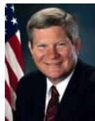
Banking, Housing, and Urban Affairs Tim Johnson D-S.D.