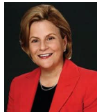
Ileana Ros-Lehtinen R-Fla.