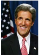
John Kerry D-Mass.