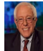
Bernie Sanders I-Vt.