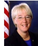
Patty Murray D-Wash.