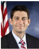
Paul Ryan R-Wis.