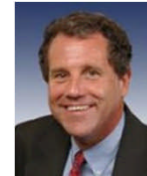
Sherrod Brown D-Oh.