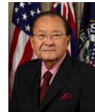
Appropriations Daniel Inouye D-Hawaii