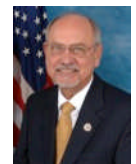
Doc Hastings R-Wash.