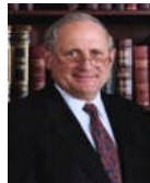
Armed Services Carl Levin D-Mich.