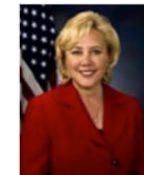
Mary Landrieu D-La.