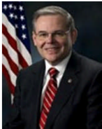
Robert Menendez D-N.J.