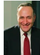
Rules Chuck Schumer D-N.Y.