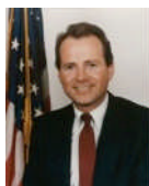
David Dreier R-Calif.