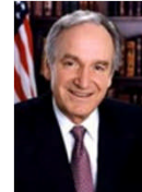
Health, Education, Labor, and Pensions Tom Harkin D-Iowa