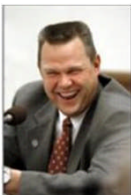
Maria Cantwell D-Wash.