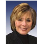
Barbara Boxer D-Calif.