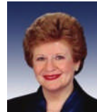
Agriculture, Nutrition and Forestry Debbie Stabenow D-Mich.