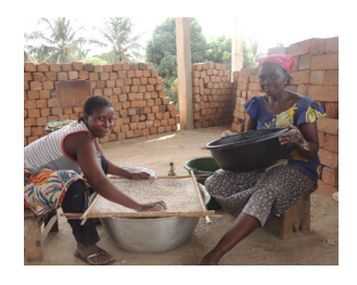
Touch, our matched charitable giving campaign, benefits Lendwithcare, a microfinance initiative that provides microloans to entrepreneurs in developing countries.

Through our Community Investment program, we volunteer with schools, shelters, clinics, veterans groups, and other charities to serve the communities in which we live and work.