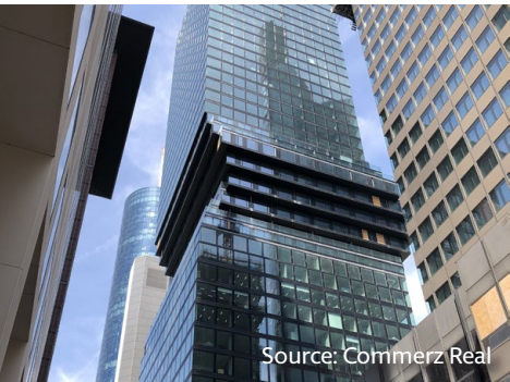
Frankfurt Große Gallusstraße 18 60312 Frankfurt am Main T +49 69 96236 0