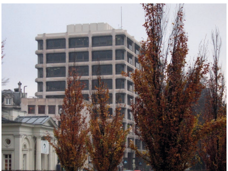
Brussels Pericles Building Rue de la Science 23, Brussels 1040 T +32 2 505 0911