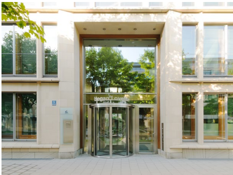
Munich Karl-Scharnagl-Ring 5 80539 Munich T +49 89 29012 0