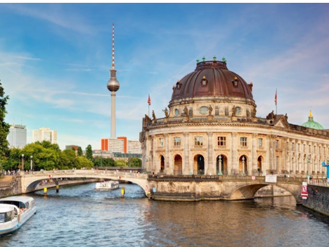
Berlin Burgstraße 27 10178 Berlin, Germany T +49 30 80 09 30 000