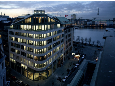
Hamburg Alstertor 21 20095 Hamburg T +49 40 41993 00