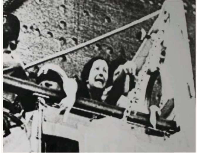
A woman cries as the St. Louis pulls away from Havana, 1939. | Keystone-france via Getty Images

Source: “Some of the 907 passengers on board the St. Louis arriving in Belgium after being refused entry into Cuba and the U.S.”, American Jewish Joint Distribution Committee Archives, “The Story of the S.S. St. Louis (1939)”, http://archives.jdc.org/educators/topics-guides/the-story-of-the-ss-st.html (last visited February 5, 2017).