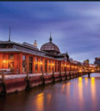
Hamburg: short-term potential