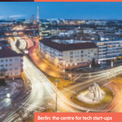
Berlin: the centre for tech start-ups