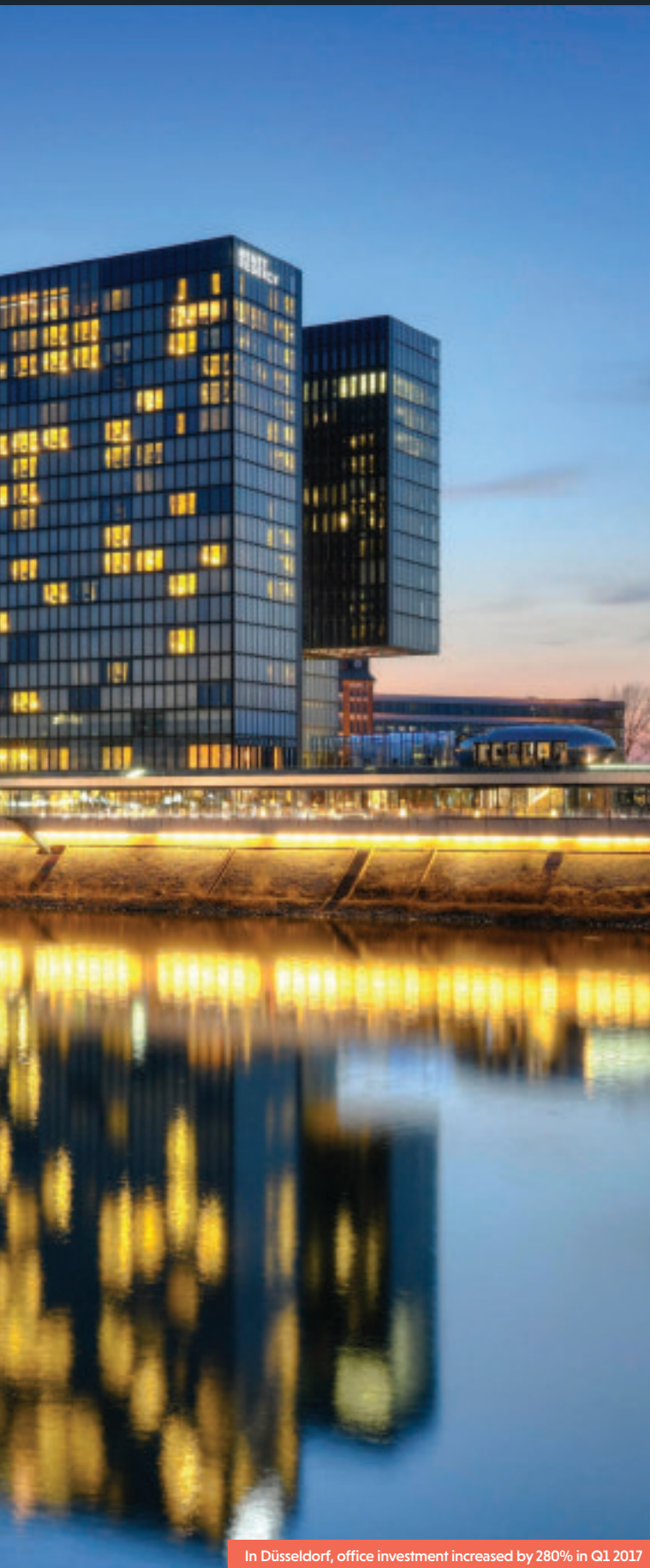
In Düsseldorf, office investment increased by 280% in Q1 2017