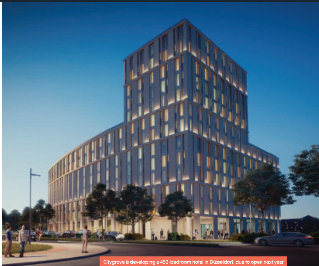
Citygrove is developing a 450-bedroom hotel in Düsseldorf, due to open next year

The flip side is that this has resulted in record lows in initial yields. "The low yields are also an expression of investors'