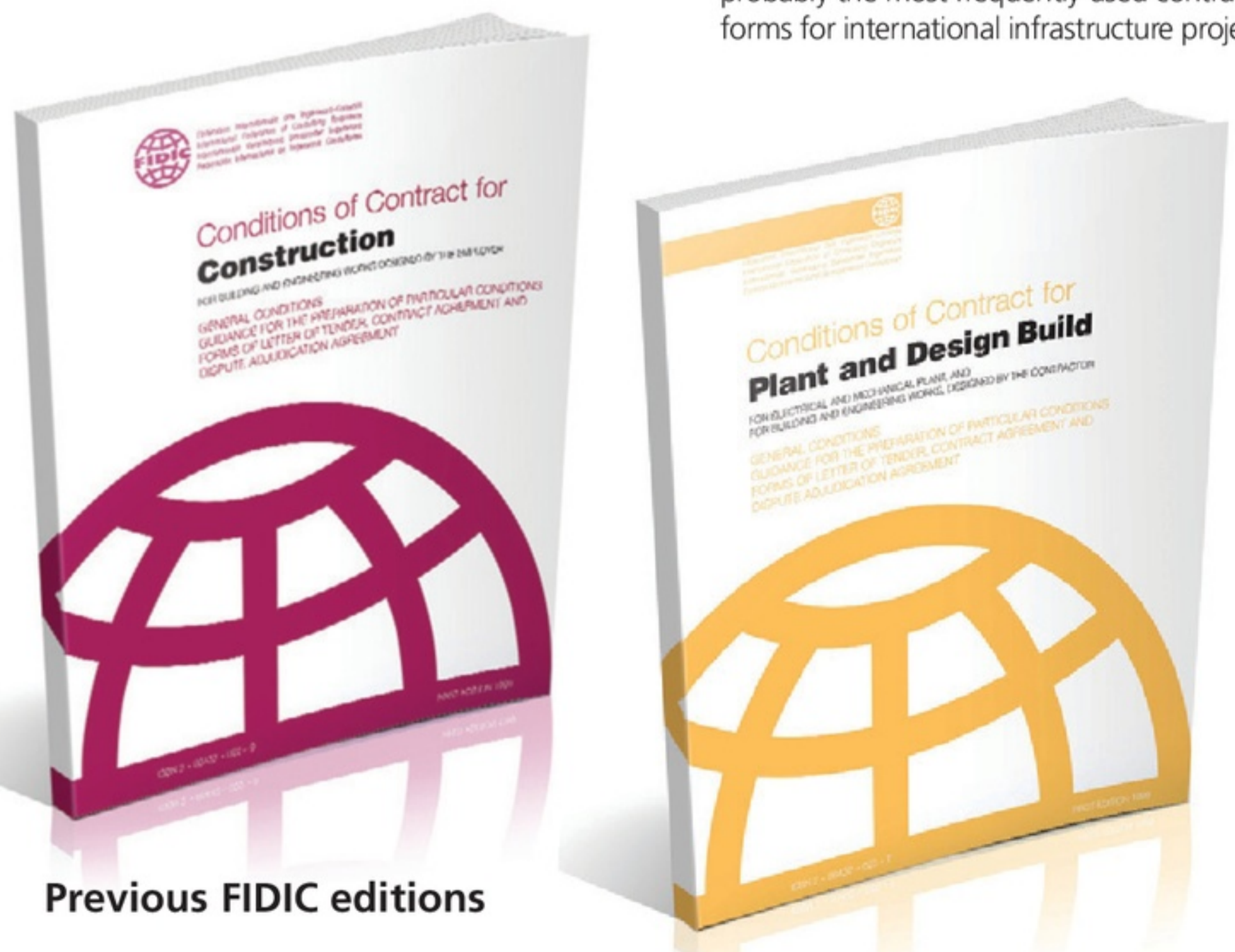
Previous FIDIC editions

Additionally, since the 1970's, ITA officials began discussions with representatives of FIDIC to include the ITA recommendations into FIDIC Conditions of Contract. These Conditions of Contract published by FIDIC are probably the most frequently used contract forms for international infrastructure projects.